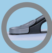
Aluminium Grey 17