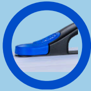
Ultramarine Blue 18