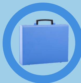
Pastel Blue 010